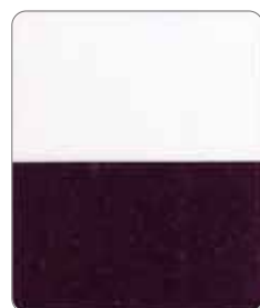
Axion Ultra Glitter Red AX-741H Size(μm) 60 - 600