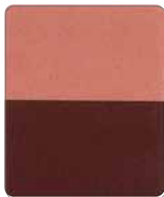
Axion Dazzling Copper AX-640K Size(μm) 6-41