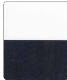
Axion Rutile Glitter pearl AX-901E Size(μm) 15-105