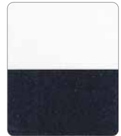
Axion Crystal White AX-901P Size(μm) 30-180