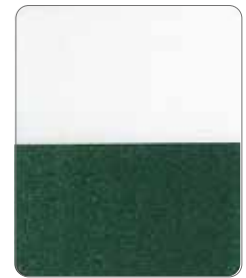
Axion Shimmering Green AX-791B Size(μm) 12-90