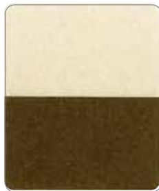
Axion Glitter Metallic Gold AX-601E Size(μm) 15-105