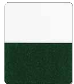
Axion Glitter Green AX-791E Size(μm) 15-105