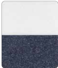
Axion Rutile Super Glitter Pearl AX-901G Size(μm) 30-230