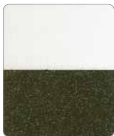
Axion Super Glitter Star Gold AX-707G Size(μm) 50-200