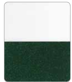
Axion Super Glitter Green AX-791G Size(μm) 30-230