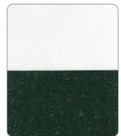
Axion Super Glitter Star Green AX-797G Size(μm) 50-200