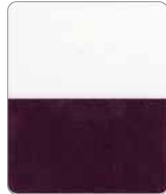
Axion Crystal Red AX-741P Size(μm) 30-180