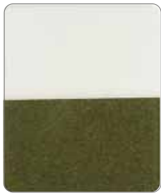
Axion Shimmering Gold AX-701B Size(μm) 15-90