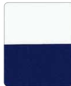
Axion Glitter Blue AX-781E Size(μm) 15-105