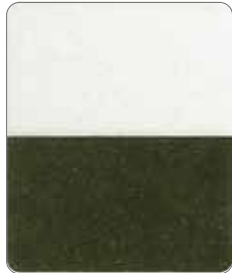
Axion Crystal Gold AX-701P Size(μm) 30-180