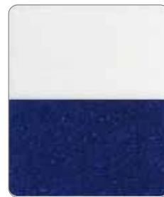
Axion Super Glitter Blue AX-781G Size(μm) 30-230