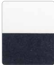
Axion Rutile Shimmering AX-901B Size(μm) 15-90