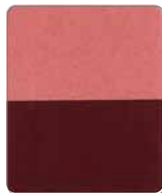
Axion Dazzling Russet AX-660K Size(μm) 6-41