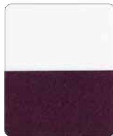
Axion Glitter Red AX-741E Size(μm) 15-105