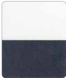
Axion Rutile Dazzling Standard AX-901K Size(μm) 6-41