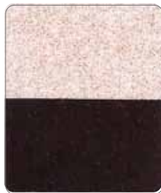
Axion Super Glitter Star Copper AX-647G Size(μm) 50-200