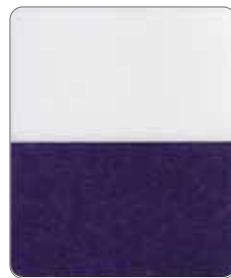
Axion Super Glitter Violet AX-761G Size(μm) 30-230