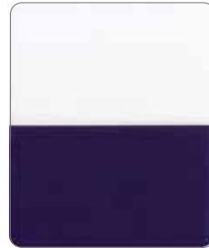
Axion Dazzling Violet AX-761K Size(μm) 6-41