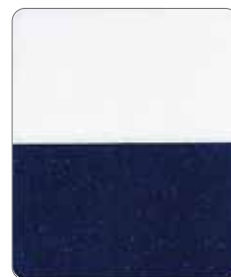
Axion Super Glitter Star Blue AX-787G Size(μm) 50-200