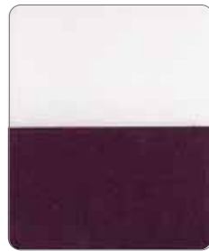
Axion Shimmering Red AX-741B Size(μm) 15-90