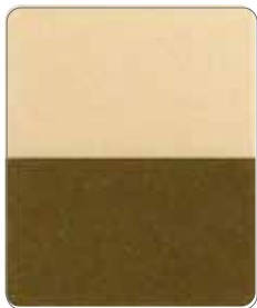
Axion Dazzling Metallic Gold AX-601K Size(μm) 6-41