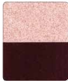
Axion Super Glitter Star Russet AX-667G Size(μm) 50-200