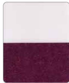
Axion Super Glitter Red AX-741G Size(μm) 30-230