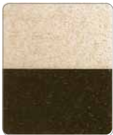
Axion Super Glitter Star Bronze AX-627G Size(μm) 50-200