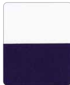
Axion Glitter Violet AX-761E Size(μm) 15-105