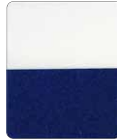
Axion Dazzling Blue AX-781K Size(μm) 6-41