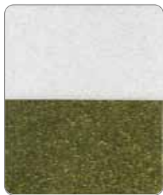
Axion Super Glitter Gold AX-701G Size(μm) 30-230