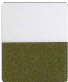
Axion Glitter Gold AX-701E Size(μm) 15-105