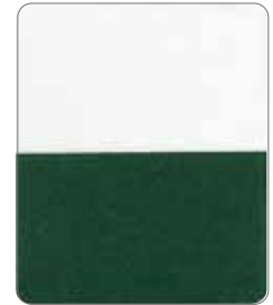
Axion Dazzling Green AX-791K Size(μm) 6-41