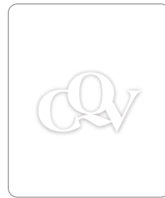
Axion Shimmering Violet AX-761B Size(μm) 15-90