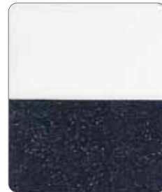
Axion Super Glitter Star White AX-907G Size(μm) 50-200