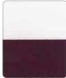
Axion Dazzling Red AX-741K Size(μm) 6-41