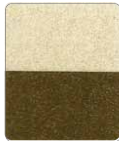
Axion Super Glitter Metallic Gold AX-601G Size(μm) 30-230