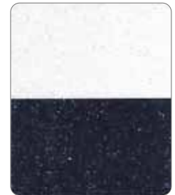
Axion Ultra Glitter White AX-901H Size(μm) 60 - 600