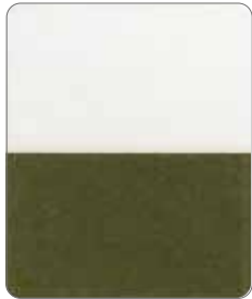
Axion Dazzling Gold AX-701K Size(μm) 6-41