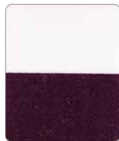
Axion Super Glitter Star Red AX-747G Size(μm) 50-200