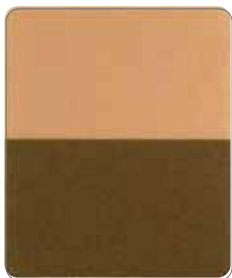
Axion Dazzling Bronze AX-620K Size(μm) 6-41