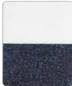
Axion Rutile Super Glitter Star AX-905G Size(μm) 30-230